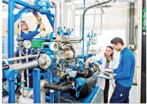
Refrigeration and cold storage laboratory