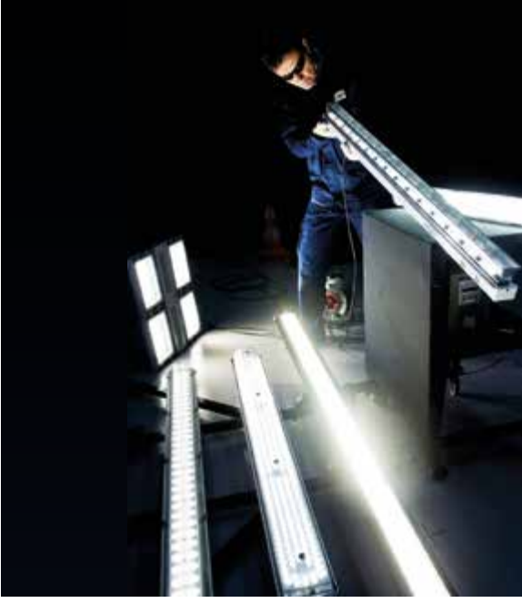
Industrial lighting technologies laboratory