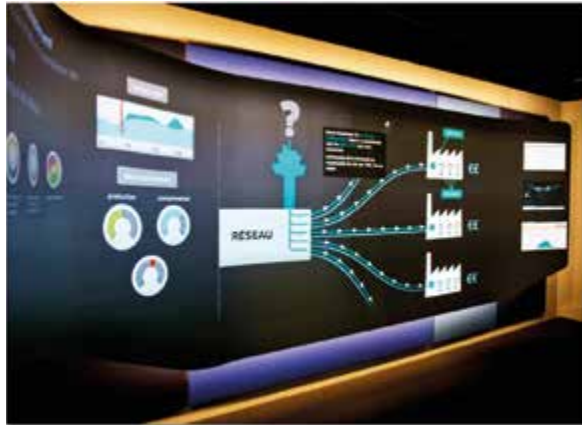
Energy management and aggregation platform