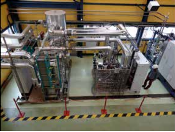
Heat pumps and heat laboratory